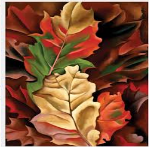
Autumn Leaves, Lake George